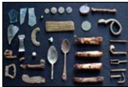
Artifacts found in the Shays' Settlement Project excavations