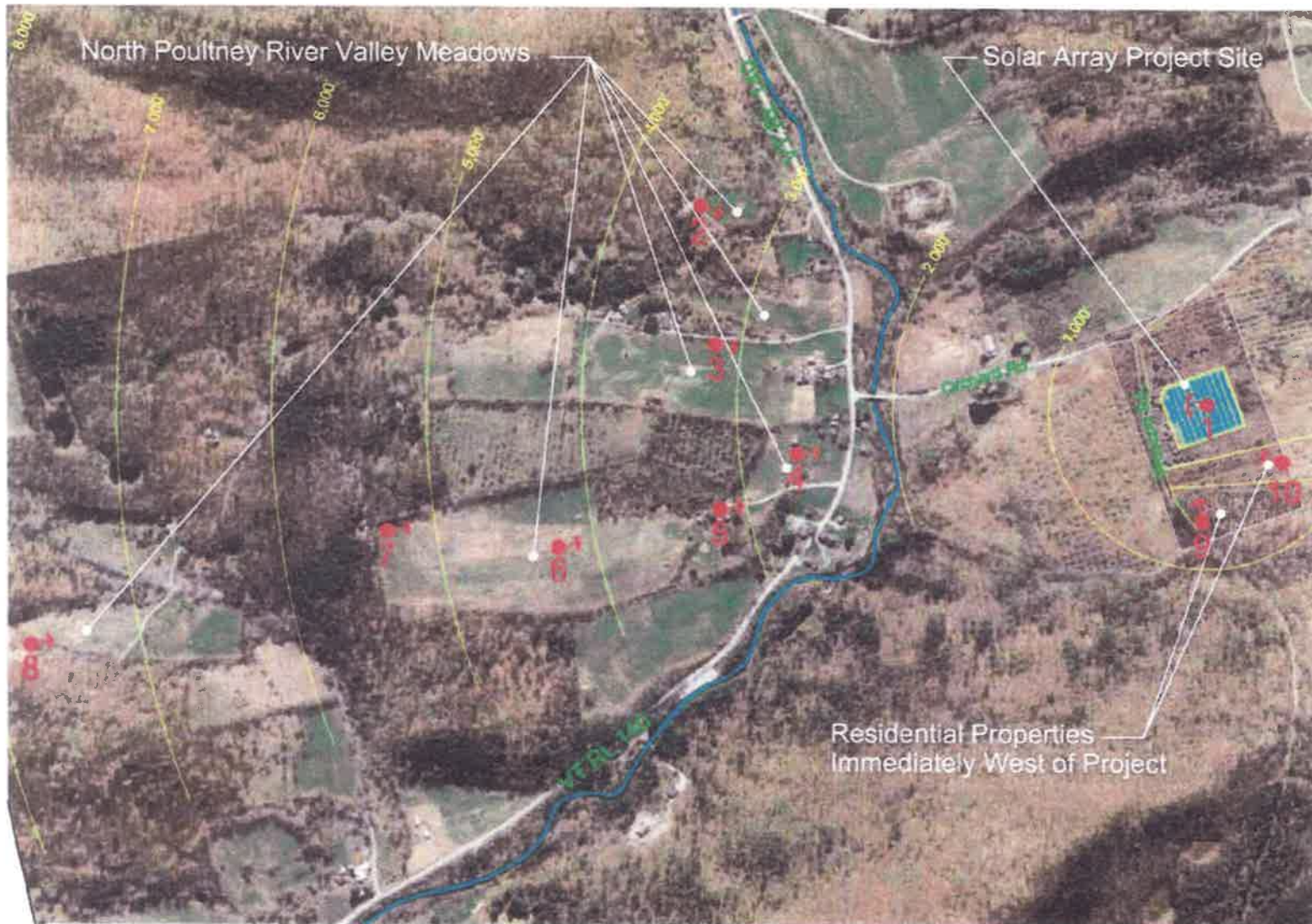
Visual Analysis for Solar Project Middletown Springs, Vermont Plan Showing Scale and Relationship of Array to South Facing Hillside Meadows North of Poultney River