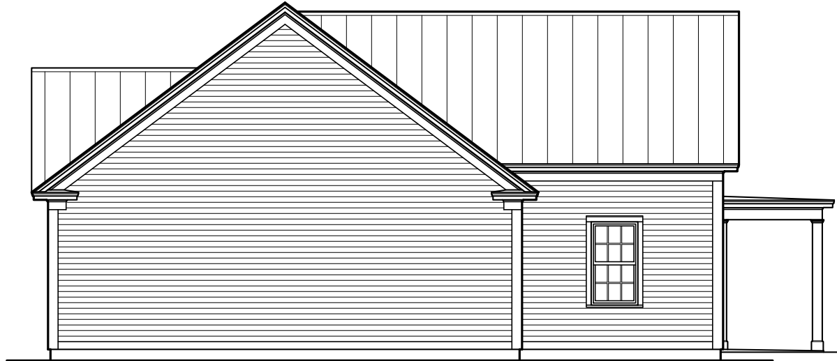
3 EAST ELEVATION A2 1/4"=1'-0"