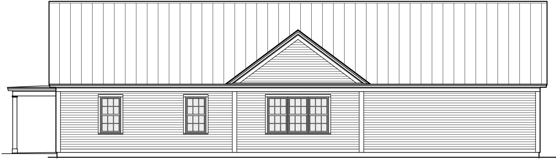
4 SOUTH ELEVATION A2 1/4"=1'-0"