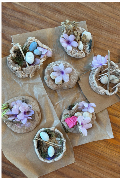
Clay bird's nests made at the Maple Festival